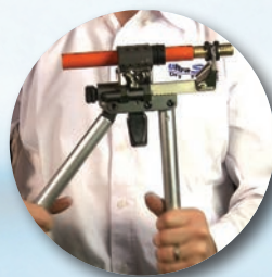
Connect the fitting and the sleeve to the pipe - in single step