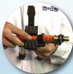
Set the fitting and the pipe in the tool