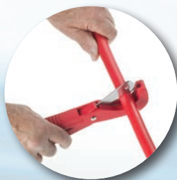
Cut the pipe